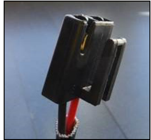
Figure 2 Connector with Clip